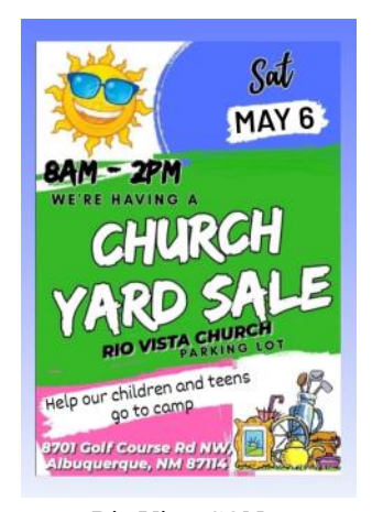
Rio Vista CON